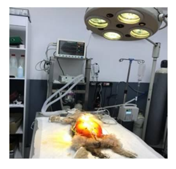
Fig. 7 Preparation of Animal to Pyometra surgery

In case of a patient with ruptured uterus, we have administered dopamine/noradrenaline (start with an infusion of 5 \mu g/kg/min iv and increase by 1 \mu g/kg/min every 2-3 min up to maximum of 15 \mu g/kg/min) because of hypotension, which may be unresponsive to fluid therapy.