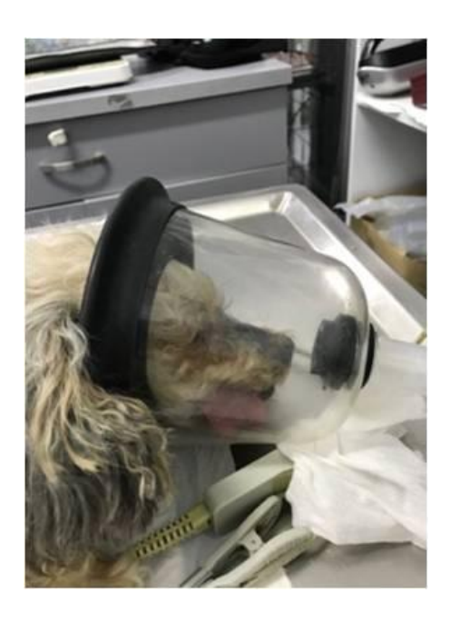
Fig. 9 A female dog with a tight-fitting face mask after surgery

The choice of anesthetic agents will depend on the severity of the patient's systemic condition (J. Verstegen, et al., (2008); (DeClue A. (2016). We have executed a protocol similar to that used for an elective ovariohysterectomy in mildly affected animals. Our protocol, in case of sicker patients, unlikely needed a sedative for Preanesthetic medication, was administrated an opioid to provide intraoperative analgesia (DeClue A. (2016). So, in these cases we used alpha-2 adrenoceptor agonists and Phenothiazines with very good results. Pre-oxygenation via a tight – fitting facemask for 3-5 minutes before induction is recommended (Fig. 8).