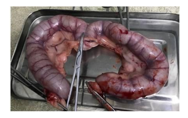
Fig 1. Pyometra in a female dog with affected symmetric horns

In the present study the majority of cases have been in the late stages of the disease and with advanced clinical signs (Fig.1).