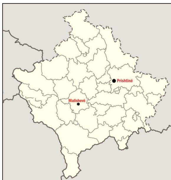
Fig. 1. Map of the Study Area

The examination was done during summer 2013-2014 period. The material for examination was tick samples from two municipality; endemic municipality Malisheve (village Astrozub) 44 samples, and non-endemic municipality Pristine (village Graçanic, Hajkobil) 158 tick samples. Identification and classification of genus of tick were done with sample methods of classification used guide of identification of tick from authors Estrada-Pena A. Bouattour J. Camicas L. and Walker R.A. 2004. For detection of genus of investigated tick we apply property, anus, mouth apparatus, cuticle, abdomen, tramp, genital apparatus, palps, spiracle. Identification and determine of genus of tick was examined with stereomicroscope, in Agricultural Faculty of Pristine, University of Pristine.