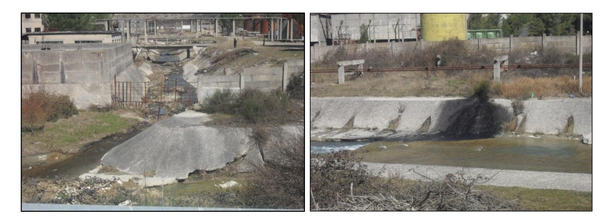
Figure 1: Direct discharged in Gjanica River of polluted water without passing through wastewater treatment plant of refinery, Ballsh.

In the pictures and table below are provided the main sources of wastewater in K.P.TH.N, Ballsh and corresponding emissions and discharges in water body and specifically on the Gjanica River: