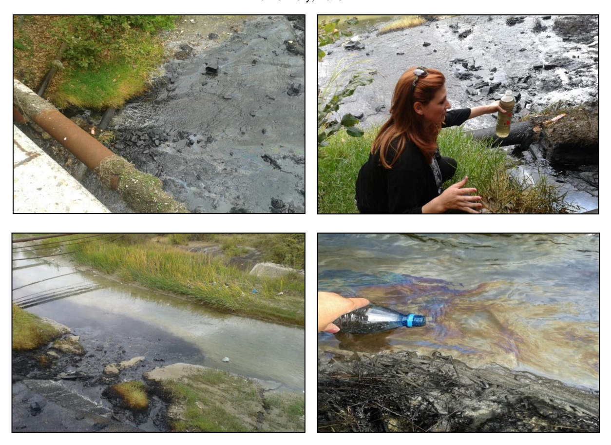
Figure 2. The discharges in Gjanica River from Balshi Oil Refinery.