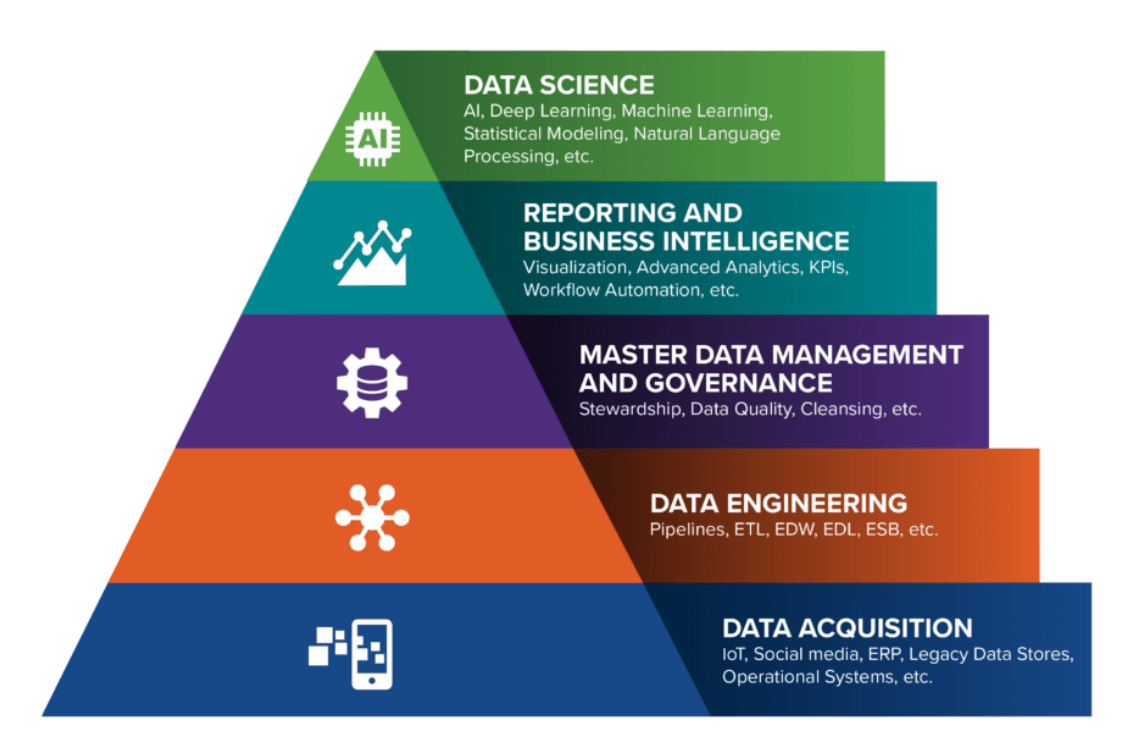
Fig. 2 Data Science Pyramid[2]

Data Science is a step by step, level by level, approach to data management. The following picture displays each level of data processing.