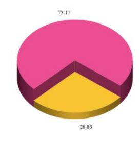
Figure 1- Students' use of digital platforms to expand their knowledge studied in CLIL subjects.

These results show up surprisingly a great quantity of students (47,8%) that consume audiovisual Japanese material utilizing English as a supporting communicative medium for understanding. Lately, students were questioned if they had ever used streaming platforms to expand any concept or explanation for any CLIL subjects. The results are these: